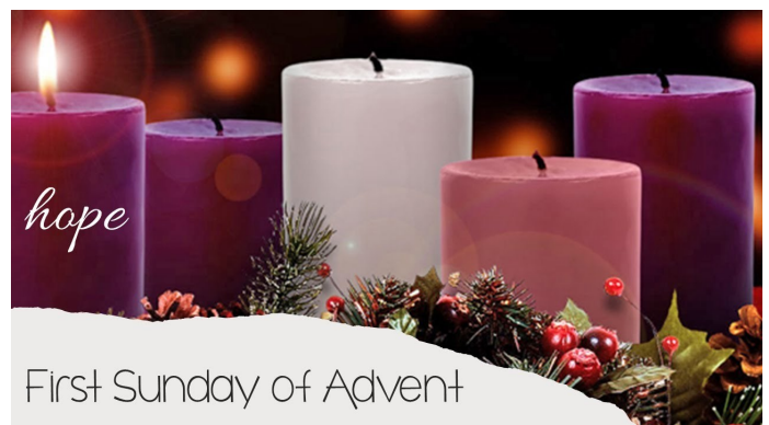
First Sunday of Advent

The Solemnity of the Immaculate Conception of the Blessed Virgin Mary is not a Holy Day of Obligation this year.