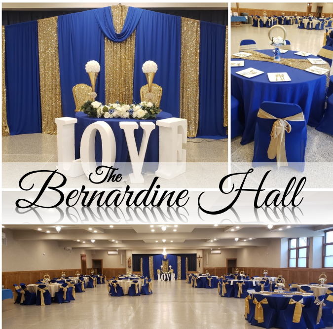
The Bernardine Hall

The Bernardine Hall is now open for reservations! Our newly renovated spacious event hall is perfect for weddings, parties, corporate events, fundraisers, and more. We have plenty of tables, chairs, space, and parking for every event. You can choose from our list of approved caterers