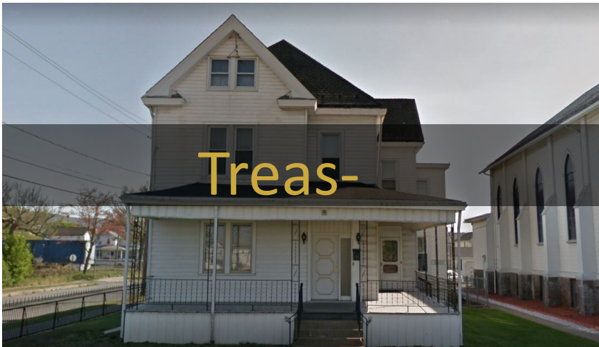
The Benedict House (155 Austin Ave)