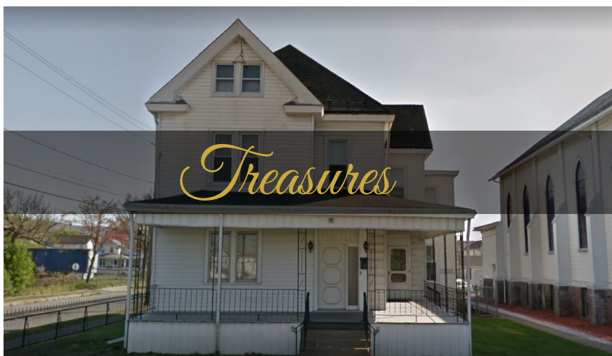
The Benedict House (155 Austin Ave)