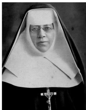
ST. KATHARINE DREXEL